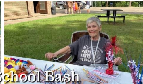
Back to School Bash