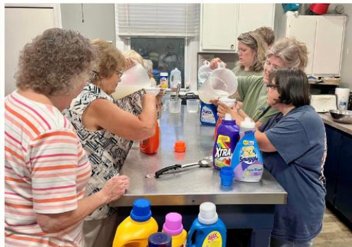
Ladies' Night Out