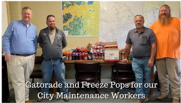
Gatorade and Freeze Pops for our City Maintenance Workers