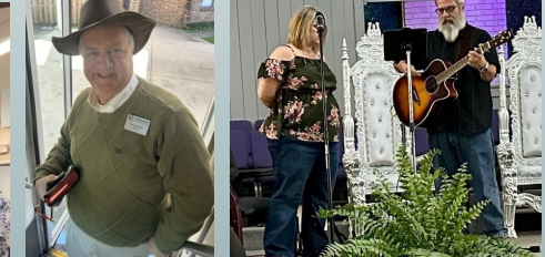
COMMUNITY THANKSGIVING SERVICE