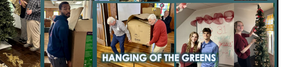
HANGING OF THE GREENS