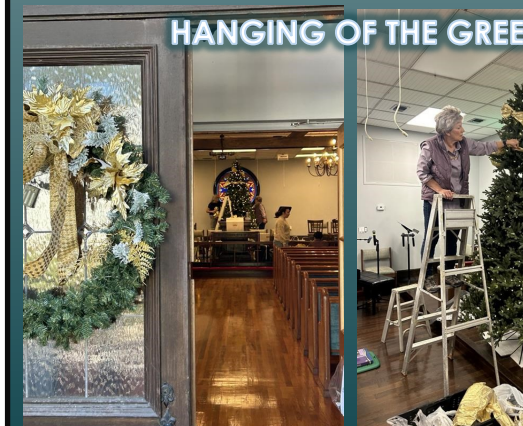
HANGING OF THE GREENS