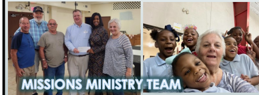
MISSIONS MINISTRY TEAM